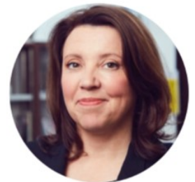
Dame Rachel de Souza